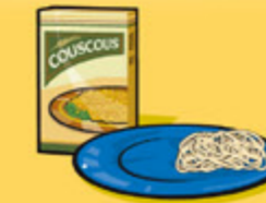
Cooked pasta or couscous 125 mL (½ cup)