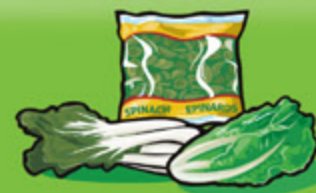
Leafy vegetables Cooked: 125 mL (½ cup) Raw: 250 mL (1 cup)