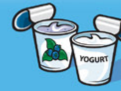
Yogurt 175 g (¾ cup)