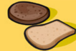
Bread 1 slice (35g)