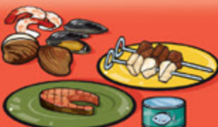
Cooked fish, shellfish, poultry, lean meat 75 g (2 ½ oz.)/125 mL (½ cup)