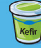
Kefir 175 g (¾ cup)