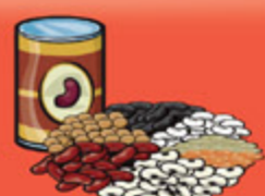
Cooked legumes 175 mL (¾ cup)