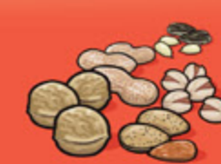
Shelled nuts and seeds 60 mL (¼ cup)