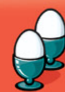
Eggs 2 eggs