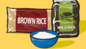
Cooked rice, bulgur or quinoa 125 mL (½ cup)