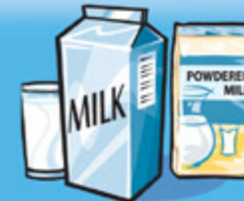
Milk or powdered milk (reconstituted) 250 mL (1 cup)