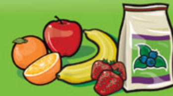
Fresh, frozen or canned fruits 1 fruit or 125 mL (½ cup)