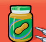
Peanut or nut butters 30 mL (2 Tbsp)