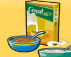
Cereal Cold: 30 g Hot: 175 mL (¾ cup)