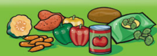
Fresh, frozen or canned vegetables 125 mL (½ cup)