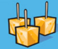
Cheese 50 g (1 ½ oz.)