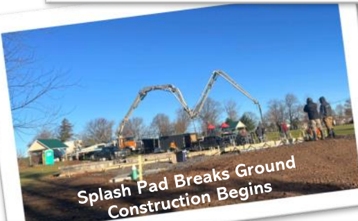
Splash Pad Breaks Ground Construction Begins