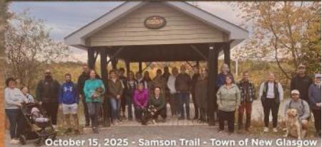
October 15, 2025 - Samson Trail - Town of New Glasgow