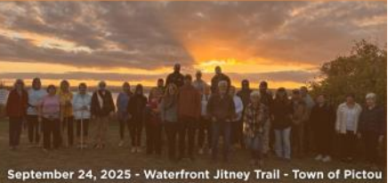
September 24, 2025 - Waterfront Jitney Trail - Town of Pictou