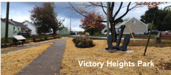
Victory Heights Park