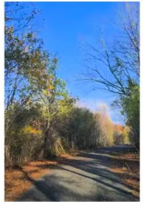
New Trail Connecting Schools