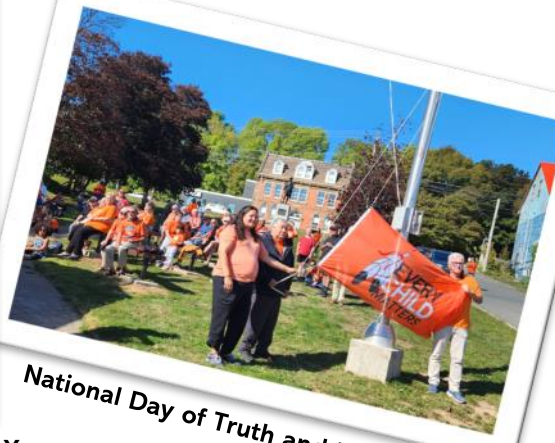
National Day of Truth and Reconciliation