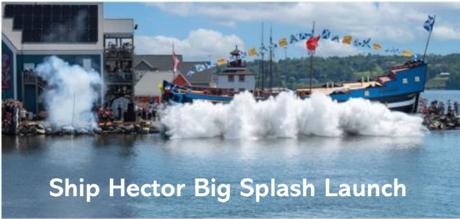
Ship Hector Big Splash Launch