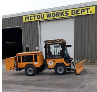
New sidewalk snow plow Public Works Department