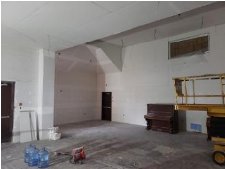
Former CN Station, Front Street Work continues on the first floor with a focus this year on heating, electrical windows and readying space for use.