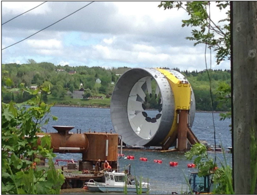
Above: Turbine Fabricated by Aecon Fabco, Pictou Shipyard