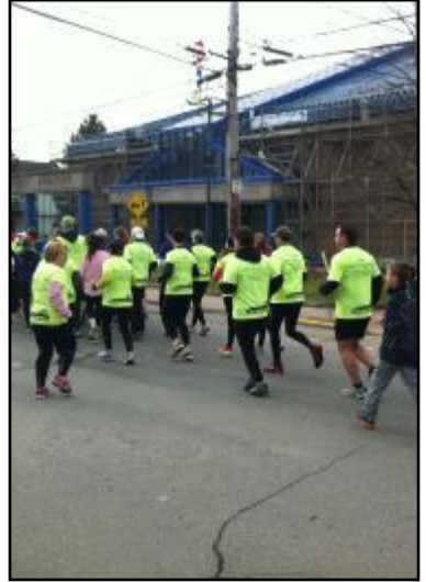
Marathon of Respect & Equality