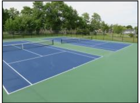
New Tennis Courts at Broidy Park

Did You Know.....you can follow Pictou on Facebook & Twitter!