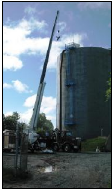
Water Tower Refurbishment

All wells have been upgraded to include inline chemistry monitoring, increased disinfection and automated controls. All thirteen wells can now be monitored and adjusted through a computer located at the Wastewater Treatment Plant. Water production can now be centrally controlled in real time while systems can be shut down and monitored from a remote location.