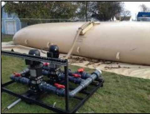
Water Tower Maintenance Water Bladder